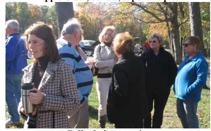
Coffee before starting