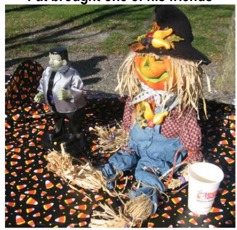
Morning coffee table decor