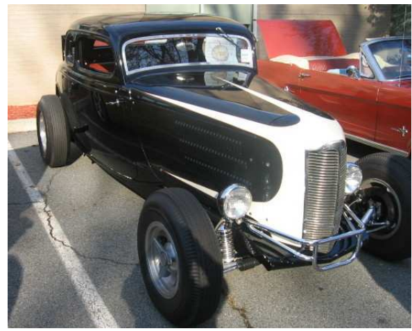
Built in the 60's-very well engineered