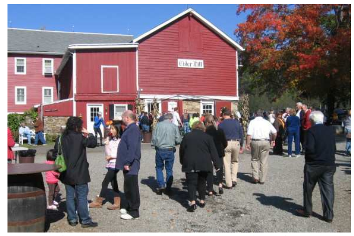
Apple Cider, donuts, super size pies