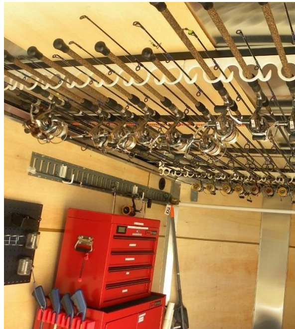
Over 25 NEW Tica rods and reels used for instruction.