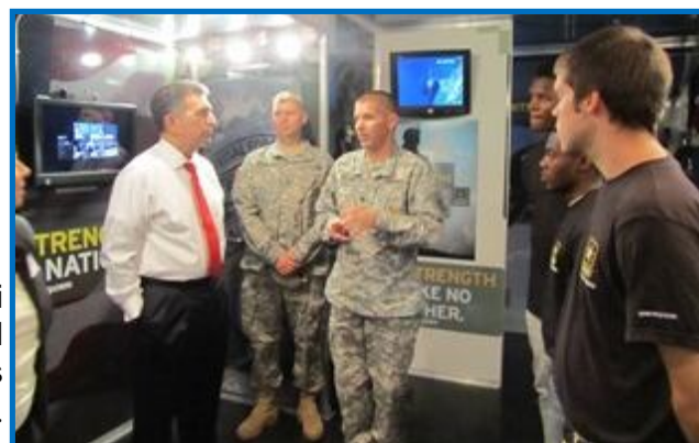
Right: Assemblyman Magnarelli takes a tour of the U.S. Army Special Forces Adventure Trailer and meets with newly enlisted soldiers.