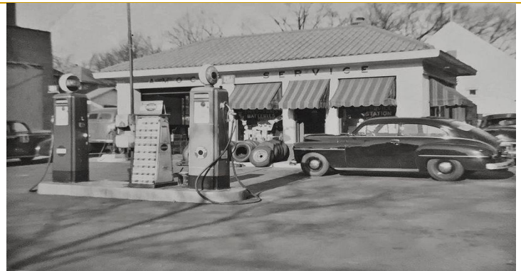
Rutherford NJ date unknown