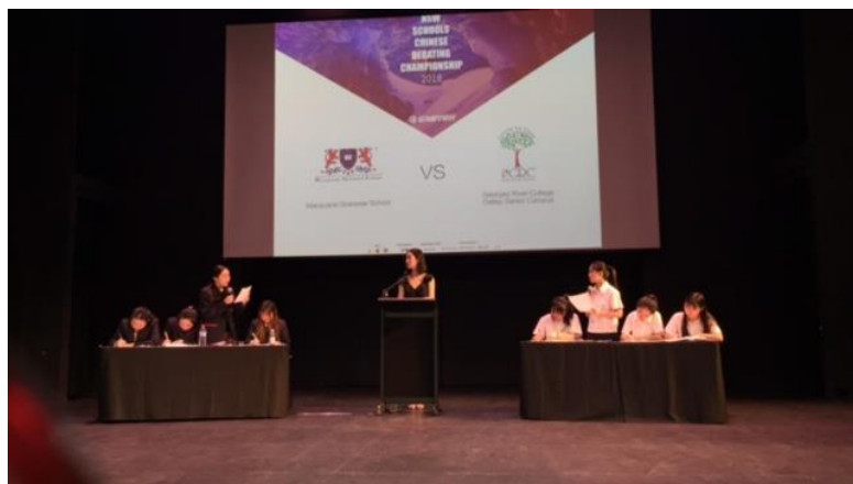
“Xinwei Cup” 2 nd Chinese Students Debating