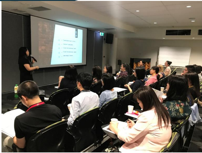
Teachers' workshop for HSC Chinese Beginners, Chinese Continuers, Chinese Extension and Chinese in Context Speaking Exams 2018