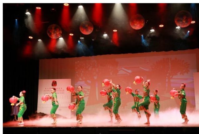
Performance in 2019 Poetry in Voice Chinese New Year Celebration