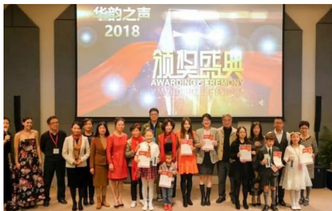
2018 Chinese Poetry in Voice Recitation Competition