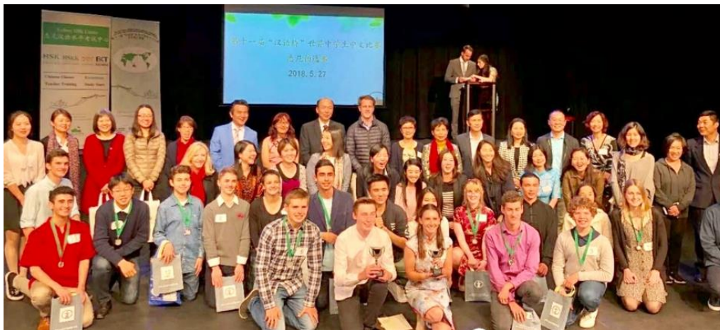
2018 Chinese Bridge Competition