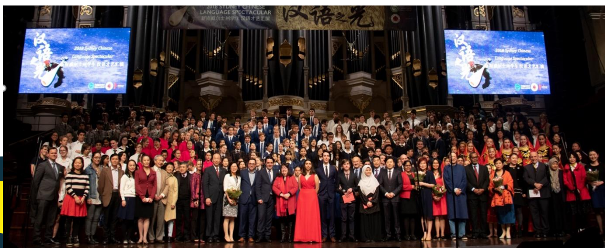
(2018 Sydney Chinese Language Spectacular )