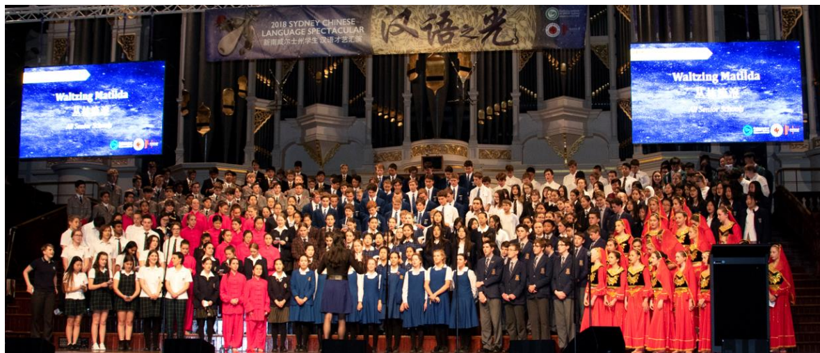
(2018 Sydney Chinese Language Spectacular)