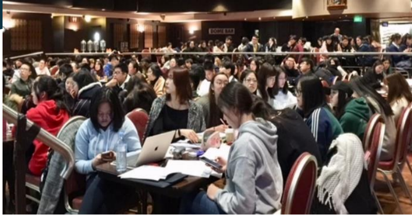
(HSC Study Day for Chinese and Literature)