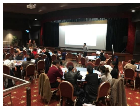
(Familiarisation Workshops on new Chinese K-10 syllabus )