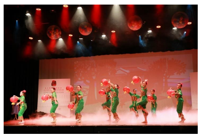
Performance in 2019 Poetry in Voice Chinese New Year Celebration