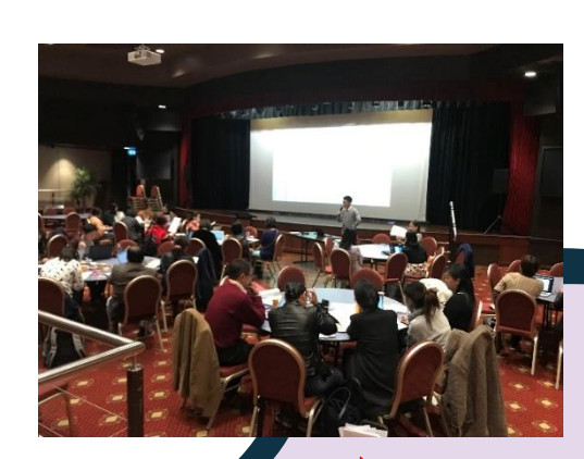
Familiarisation Workshops on new Chinese K-10 syllabus)