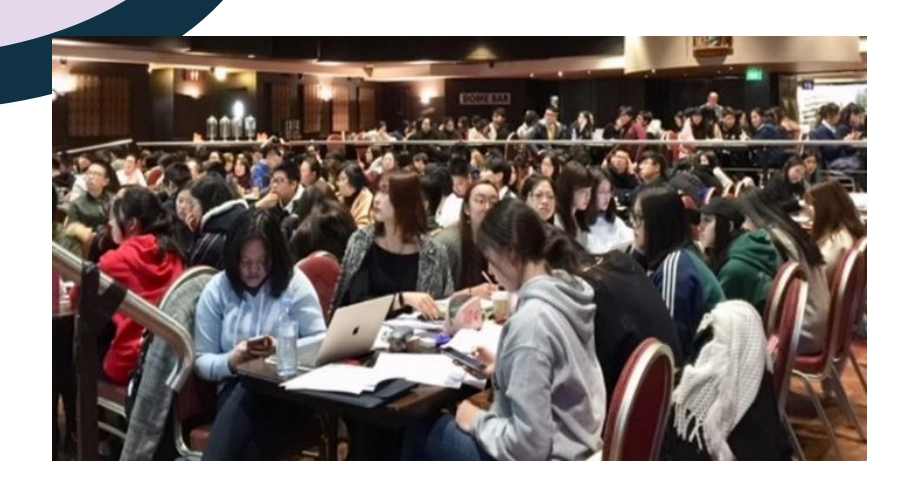
(HSC Study Day for Chinese and Literature)