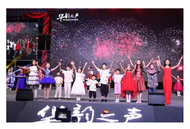
2018 Chinese Poetry in Voice Recitation Competition