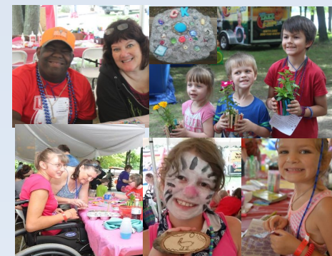
Art & Crafts