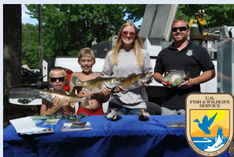
Genoa National Fish Hatchery

Note: At check-in you will be given a schedule and map for ALL exhibits and activities.