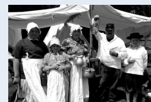
Old Time Family Photos