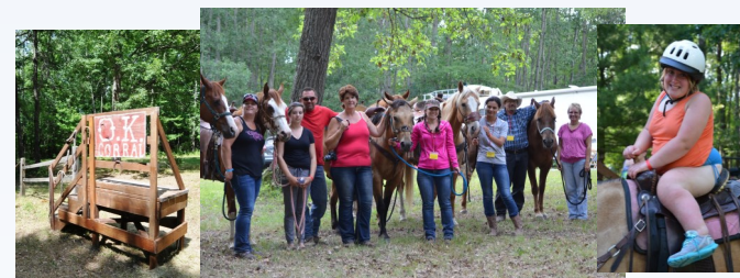
Horseback Riding at the O.K. Coral

Please don't forget to pick up your "punch card" at check-in for a chance to win a $100.00 gift card and your "scavenger hunt card" for a chance to win awesome prizes.