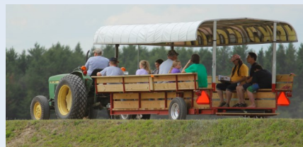
Cranberry Marsh Tour & Wagon Rides