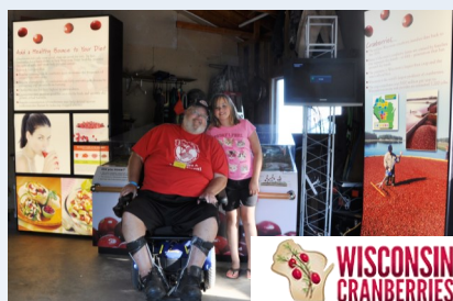
The WI State Cranberry Growers Assoc.