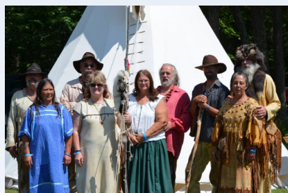
Big River Long Rifles