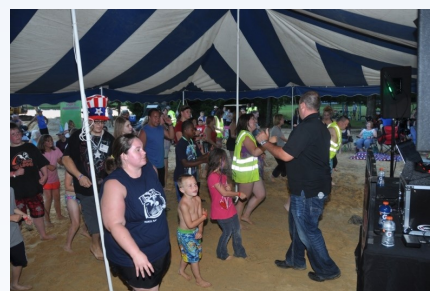
Into the evening, the fun never stops!