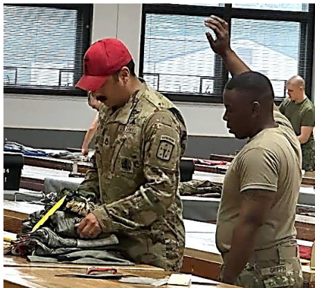
Soldier raises his hand for his parachute to be inspected.