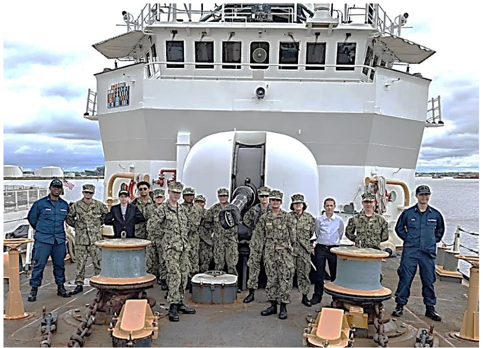
AMERICA Division Sea Cadets recently toured USCGC Northland at the U.S. Coast Guard Base Portsmouth, VA.