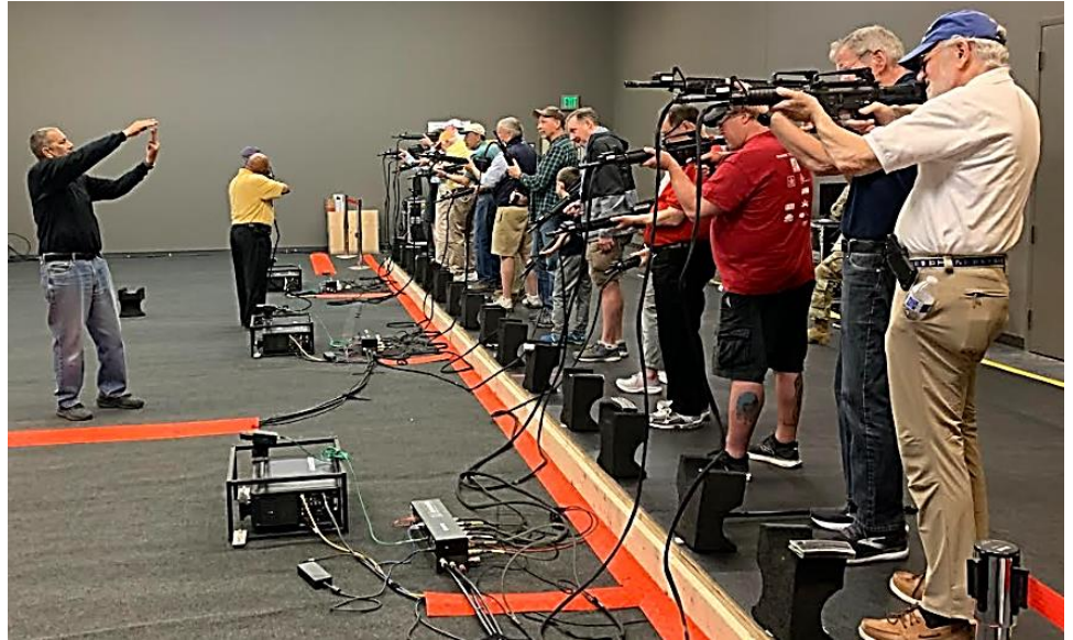
Instructors give safety and usage instructions to fifteen members of our group before experiencing target practice with electric replicas of the M-16 weapons. Great fun!!