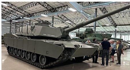
Group learns the history of the XM1 Abrams Tank.