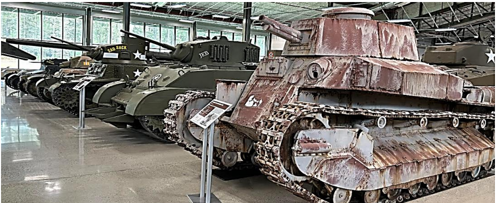
French, German and British tanks on display in the USA Ordnance Corps Museum.