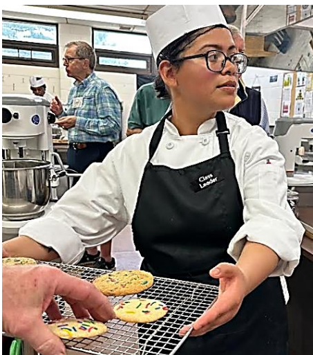
Student shares cookies with group.