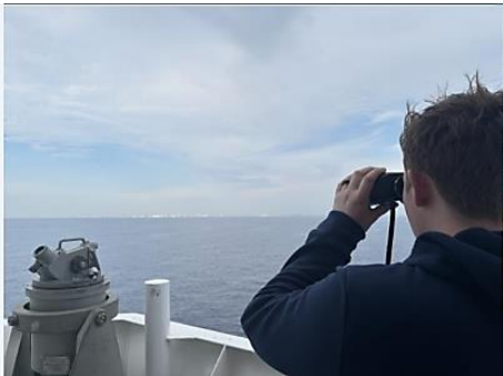
Keeping a lookout.

As always, thank you, Richmond Navy League, for supporting us! We look forward to sharing more good news soon and having you onboard when we return in April! 🍷