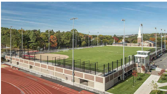
WORCESTER POLYTECHNIC INSTITUTE