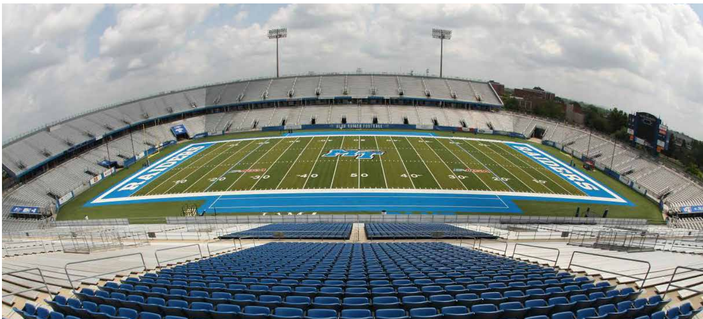
MIDDLE TENNESSEE STATE UNIVERSITY