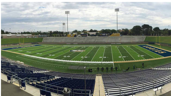
UC DAVIS // AGGIE STADIUM