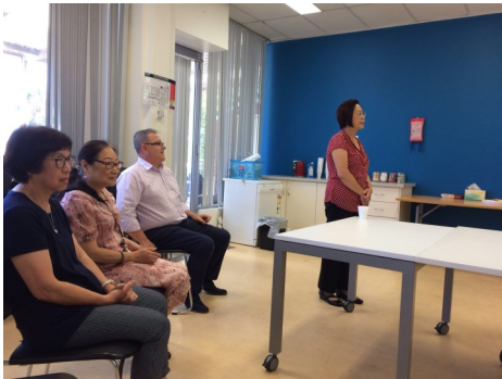
Farewell morning tea at MRC