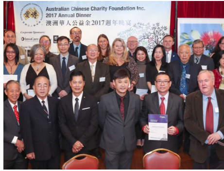
ACCF cheque presentation