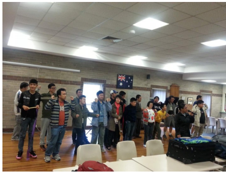
Music and dance class