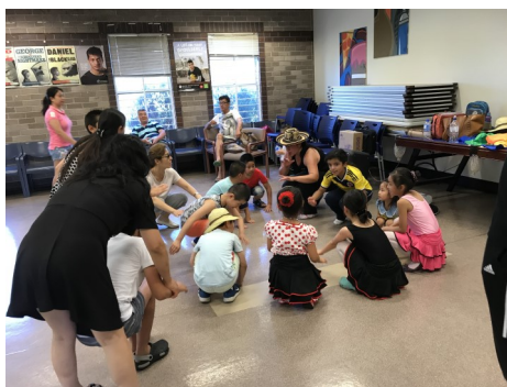
BEAM project—Junior Group