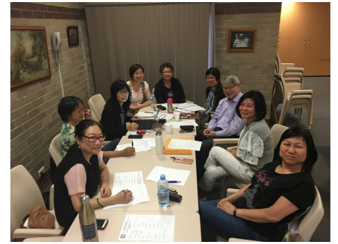
Booklet editorial team