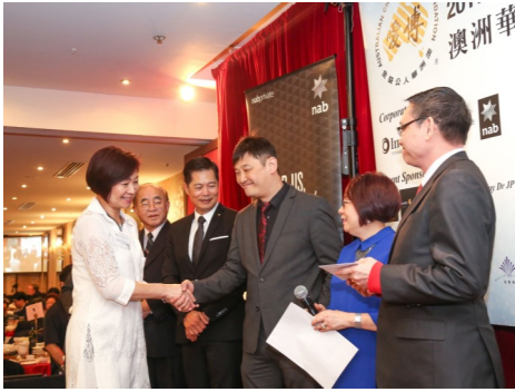
ACCF cheque presentation