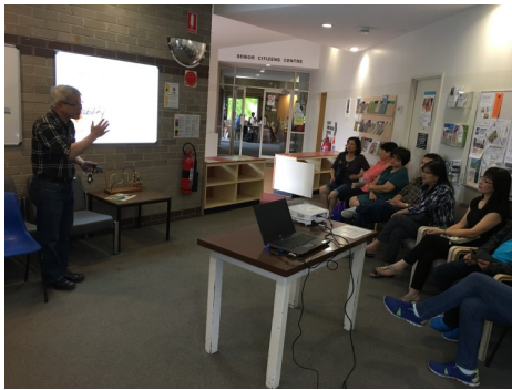
Seminar for parents