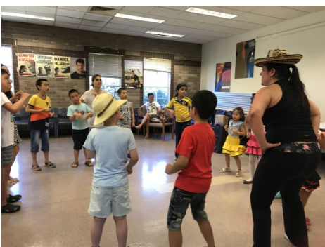
BEAM project—Junior Group