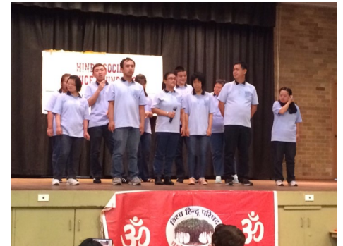
Performance at Ermington CC