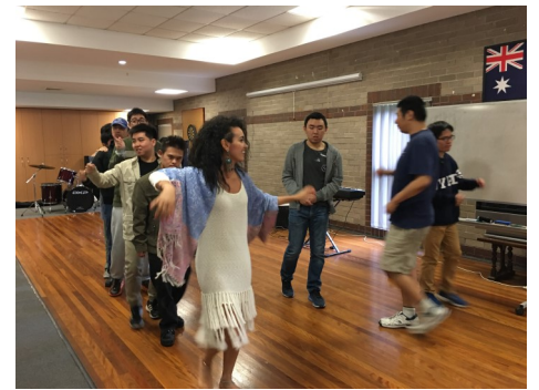
Music and dance class