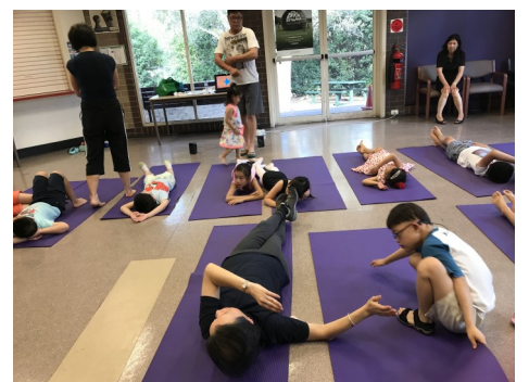
BEAM project—Junior Group