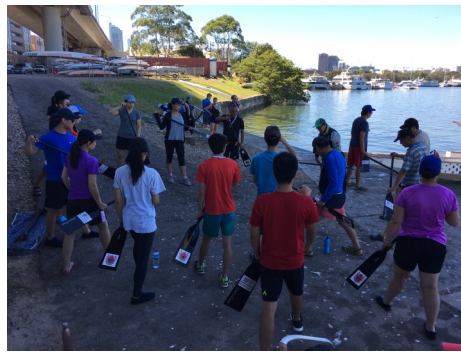
Dragon boat training 2018