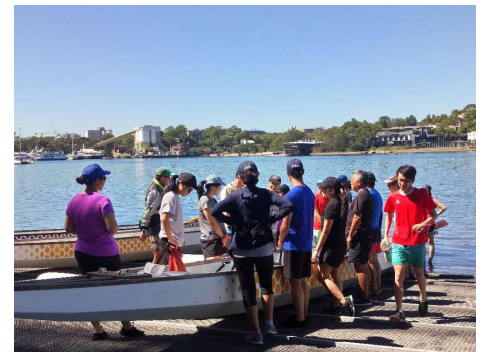
Dragon boat training 2018