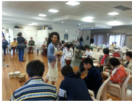
Music and dance class