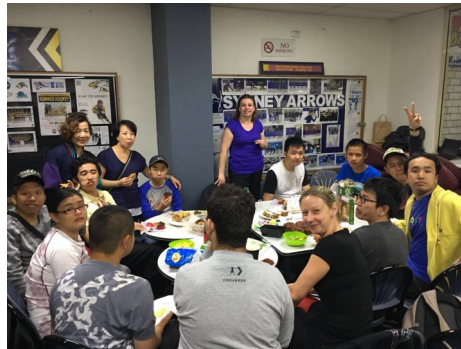
Morning tea at Ice-Skating Rink