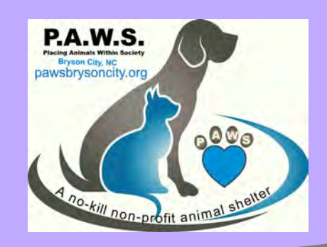
Help Us Save More Lives!!!