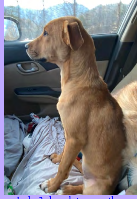
Lola 3 days later, on the mend