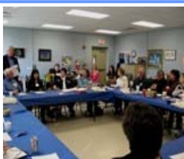
WCAC Task Force Meeting