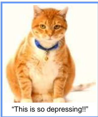
"This is so depressing!!"

O besity is considered the most common nutritional disorder in dogs and cats. As with us humans, it is increasing as a health issue and is described as the deadliest of diseases and also the most preventable. That is especially unfortunate since in most cases, we are responsible for our pet's weight . In general, their weight is a factor of "too much food and too little exercise." Sound familiar?