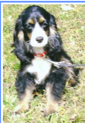
Precious, definitely my after picture

Every day, 365 days a year, a PFA volunteer “picks up” calls from our SNAP phone line from pet owners needing financial assistance to spay or neuter their pet(s). Different levels of assistance are offered based on need and are paid directly to veterinarians when a surgery is done. These are thumbnail sketches of conversations that usually provide support, education, AND financial assistance.