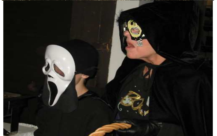
Goblins bearing gifts