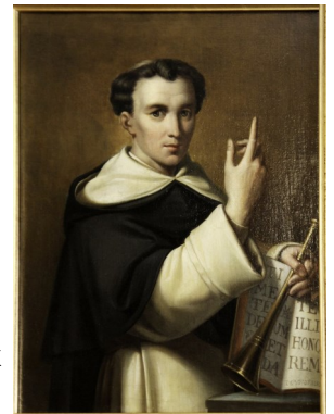
Feast Day: April 5

Vincent was born in Spain around 1357. He joined the Dominican Order when he was 19. It was a difficult time for the Church because of a dispute about who the true pope was. Vincent tried his best to heal the differences between the two groups, but his work was unsuccessful. Vincent prayed that God would give him the direction he needed in his life. Following an illness that nearly took his life, Vincent felt that God was calling him to spread the Gospel, just as Jesus had asked his Apostles to do.