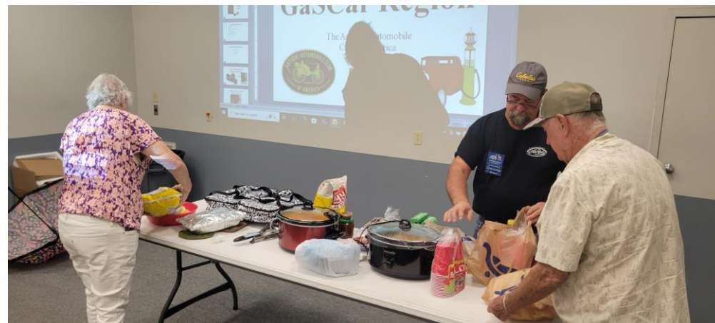
Preparing for August Snacks