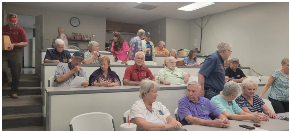
August Monthly Meeting