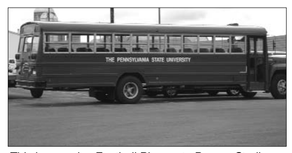
This bus carries Football Players to Beaver Stadium, Think Penn State!

Keep checking out the EEVC web site, www.eevc.info for the latest details. Plans are under way to have another great event. If you want to attend contact us.