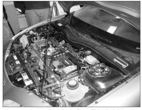
Under the hood of the Penn State EV-1, hybridized with hydrogen.