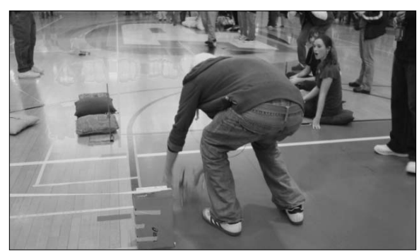
Across the finish line

Since this year's event goal was to design the fastest car between a start and finish line, while staying within track boundaries, a winning design had to display both quickness and straight line velocity. Many of the cars traveled straight until they reached a certain