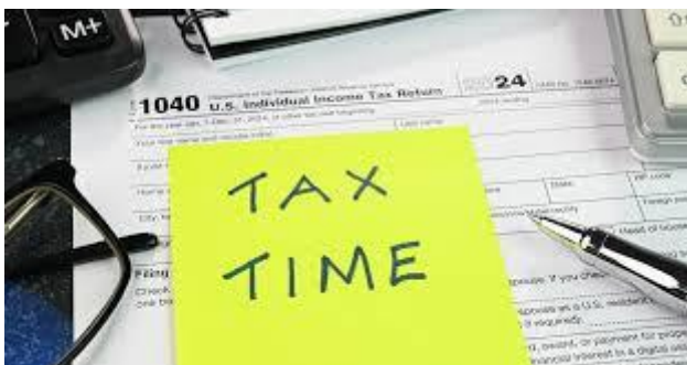
The Ides of April

Arbor Day Plant one April 24 - plant a tree