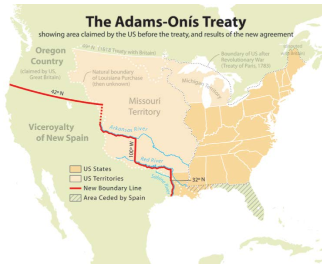
The 1819 Adams-Onís Treaty Borders With Spain

Over the next two decades, Oregon develops gradually, with Ft. Vancouver, 90 miles inland from Ft. Astoria, becoming the hub of the fur trade, and the Hudson Bay Company reasserting its dominance. The 1818 “joint occupation” bargain with Britain is extended in 1827.