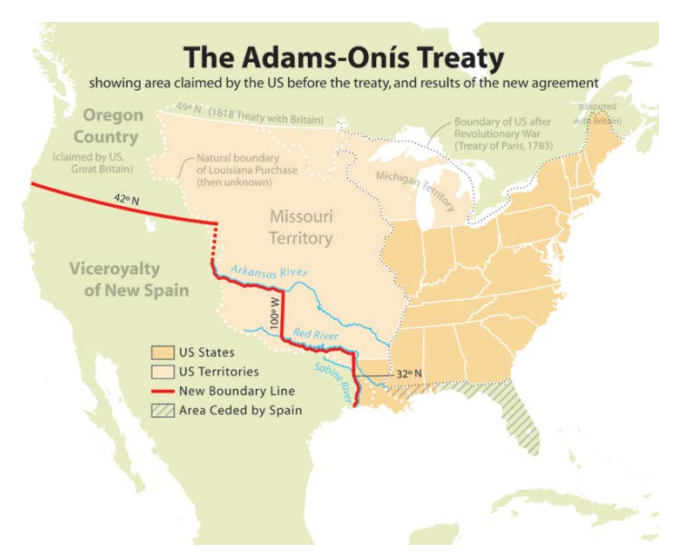
The 1819 Adams-Onis Treaty Borders With Spain

Over the next two decades, Oregon develops gradually, with Ft. Vancouver, 90 miles inland from Ft. Astoria, becoming the hub of the fur trade, and the Hudson Bay Company reasserting its dominance. The 1818 "joint occupation" bargain with Britain is extended in 1827.