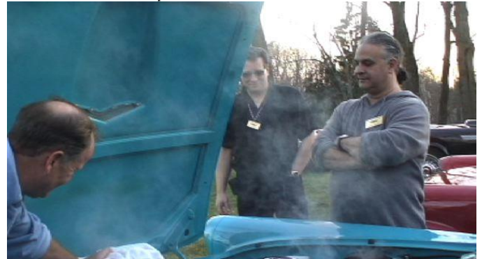
A small overheat problem