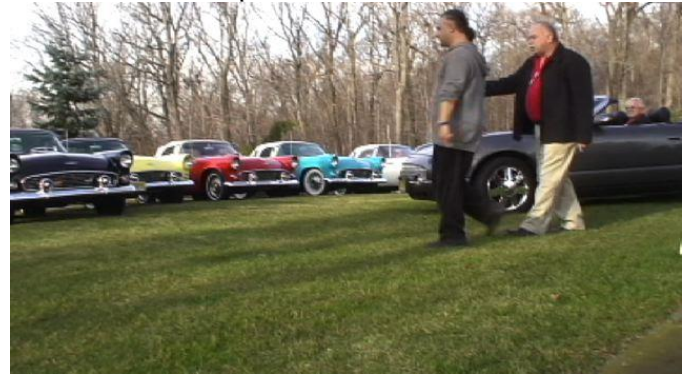
The VP giving suggestions on how to park