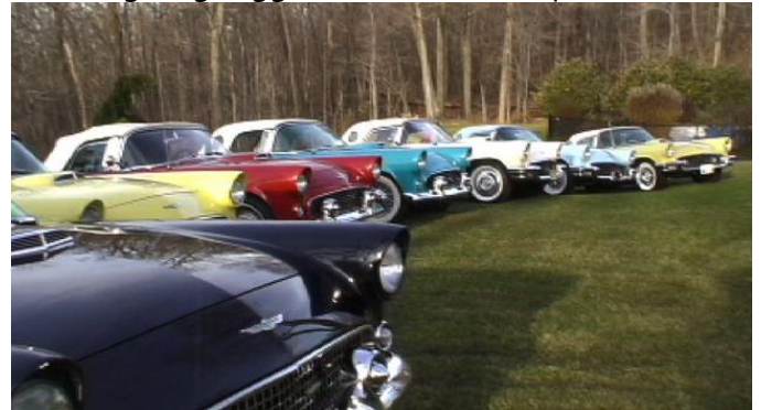
Beautiful Birds on Beautiful Grass