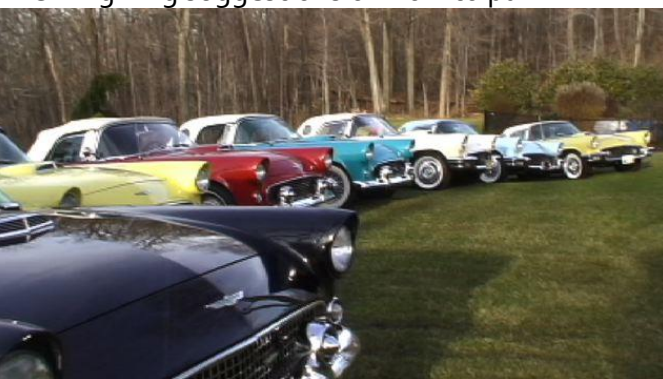
Beautiful Birds on Beautiful Grass

The VP giving suggestions on how to park