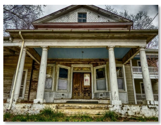
Purvis Store - Current State

PROJECT DESCRIPTION: Built in the early 1900s, the store and adjacent outbuilding are listed on the National Register of Historic Places as a Contributing Resource to the Southern Albemarle Rural Historic District and is listed on the Albemarle County Important Country Stores list along with two other stores in Esmont: Payne's Store and Pace's Store.