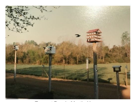
Esmont Purple Martin Houses

PROJECT DESCRIPTION: Ballinger Creek runs through the historic village of Esmont, (the Village), mostly in an area that is a flood plain, creating a situation ideal for a Wildlife Refuge.