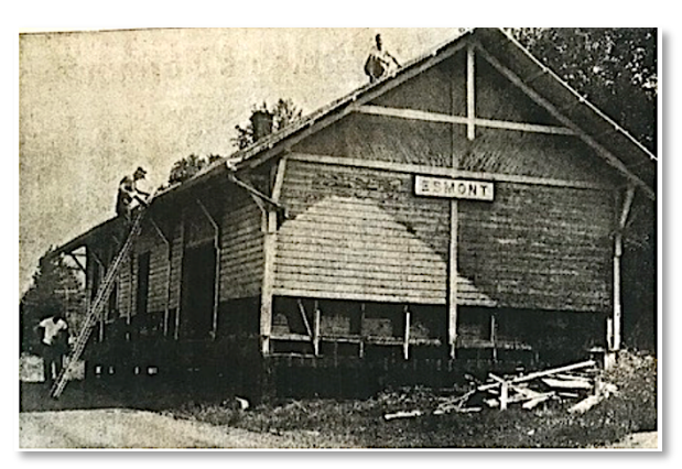
Esmont Depot Being Dismantled, 1964

PROJECT DESCRIPTION : The Esmont Depot was torn down and the railroad tracks were taken up in 1964, leaving the historic village of Esmont (the Village) with only a vacant pathway as a reminder of its busy railroad days when soapstone, slate, pulp wood, railroad ties, and mail traveled from Alberene, Esmont, Schuyler and Warren to places around the world.