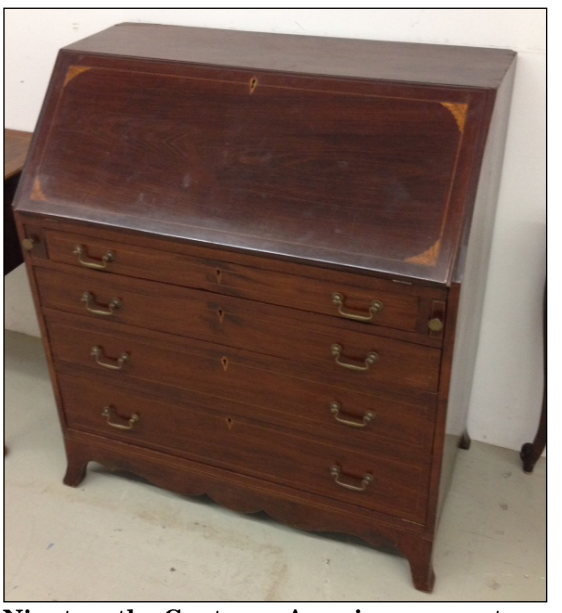
Nineteenth Century American secretary desk with marquetry wood inlay.