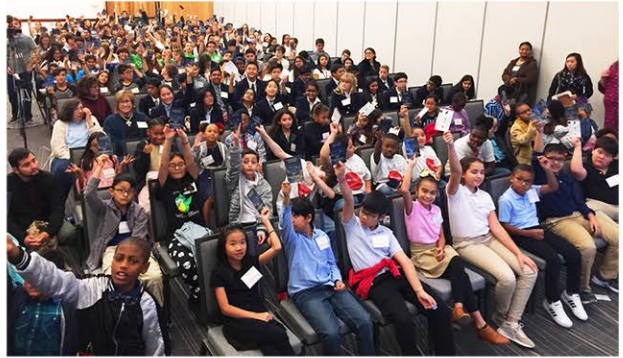
SteamSpace Education Outreach - November 2018