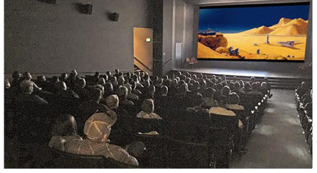
Seattle Museum of Flight - August 2019