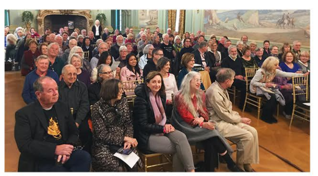
Filoli Historic Trust - March 2019