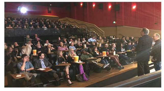
Newport Beach Film Festival - May 2018