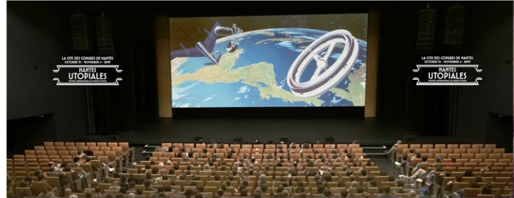
Ahrya Fine Arts Theatre - August 2019 Les Utopiales Festival de Science-Fiction - Nantes, France