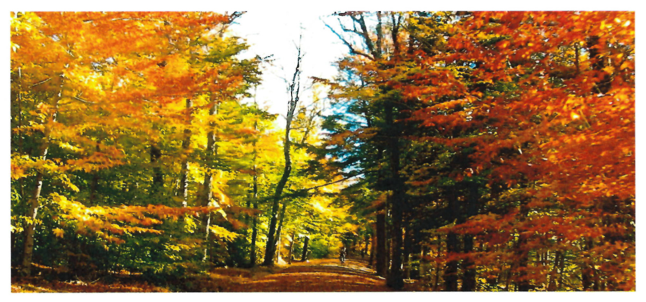
Escape to what has been named the most upcoming natural Class A RV resort destination in the United States. Most people call NATURES WILDERNESS RESORT a place where your mind, body, and soul will relax and become one with nature.