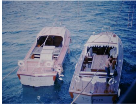
Off coast of Cuba during shake down cruise out of the PHL dry dock shipyard where we were outfitted with a bunch of new equipment but received no training on how to use.