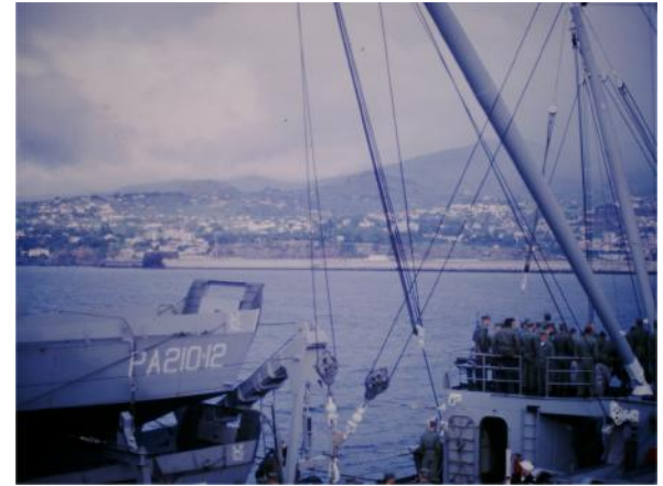
Telfair during a Med cruise off port.