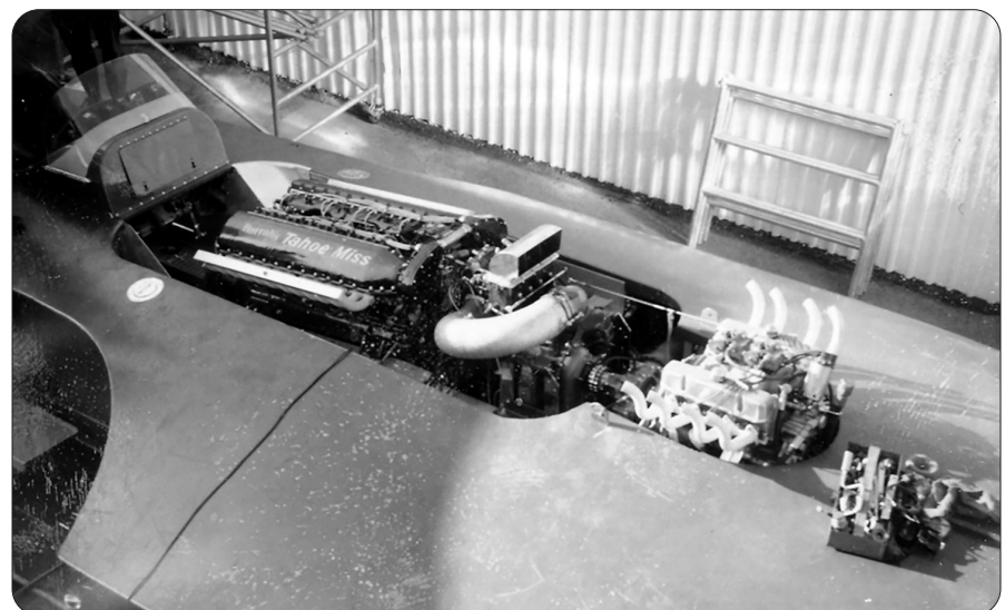
The Tahoe Miss with the Buick engine driving the auxiliary supercharger.