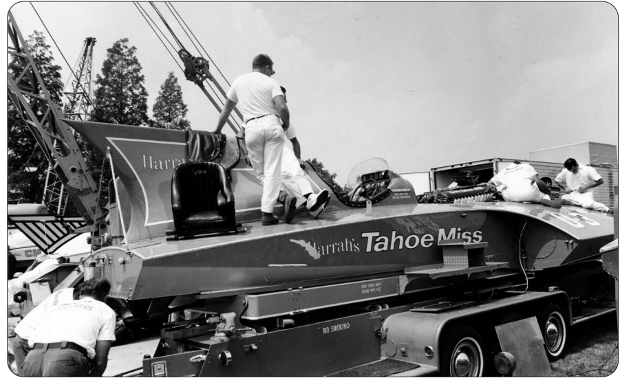
The crew works on Tahoe Miss in 1966.

Yeah, it was huge. It had duct work. There are some pictures floating around of this thing in the boat. They took the auxiliary supercharger out, put this thing in, and it used exhaust gas to run a turbine, which ran a compressor and then the compressor was ducted to feed into