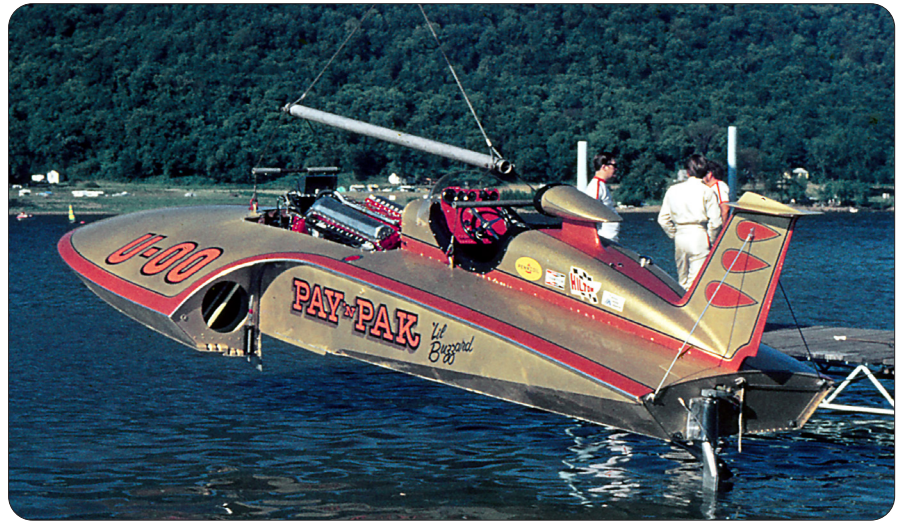
Pay 'n Pak 'Lil Buzzard at Madison, Indiana, in 1970.

The Chrysler people finally announced they're ready, they finally got it working, it's really, really good. We're set and we're gonna do good now 'cause we got it all sorted out. They actually did run pretty darn good for the first couple