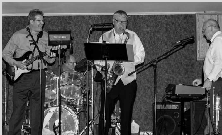
RENDITION – Friday, July 25 (6-9 p.m.)