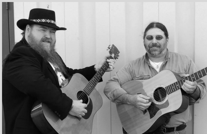
Chapman Brothers Band – Saturday, July 26 (6-9 p.m.)