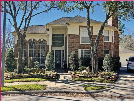
Section 1 9226 Brahms Lane