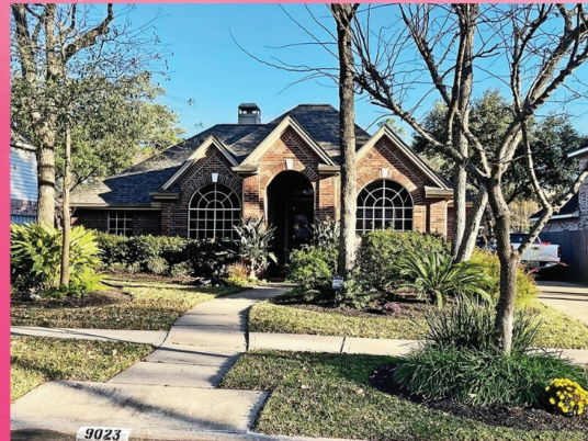
Section 2 9023 Rhapsody Lane