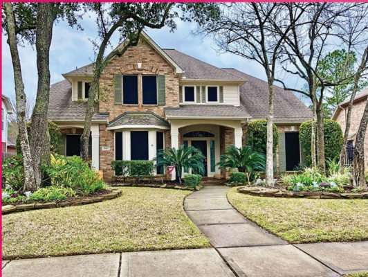
Section 3 8615 Prelude Court