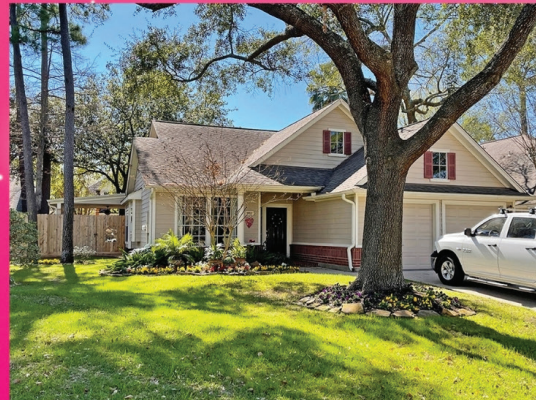
Section 4 9307 Rhythm Lane