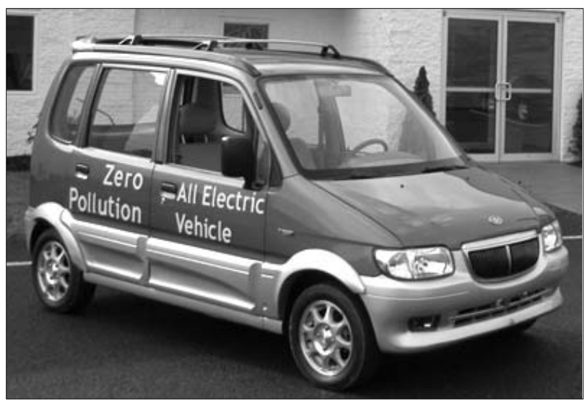
The ZX40 from Miles Automotive is an NEV that looks like a little SUV.

A company called Miles Automotive begun has importing a Chinese-built neighborhood electric vehicle that may appeal to Americans who otheri s e wouldn't be interested in EVs — or who perhaps dislike the wimp image some associate with them.