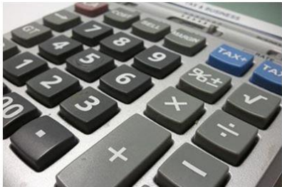
Pediatric Dosing Calculator