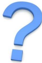
Frequently Asked Questions (FAQ)