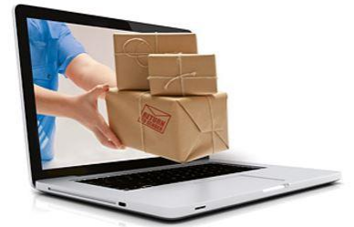
Product Order Portal