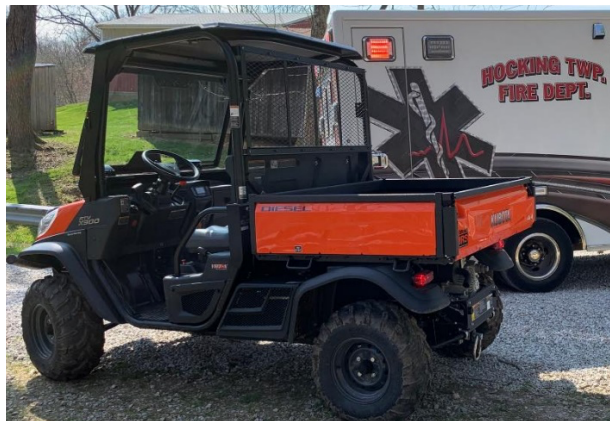
Medic/Squad 653 (Reserve)