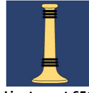
Lieutenant 651 Kyle Parlier Fleet Maintenance