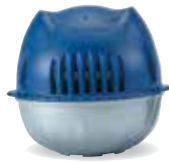
FROG® @ease® FLOATING SYSTEM