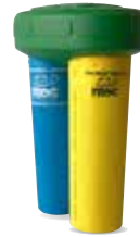
FROG Serene™ FLOATING SYSTEM