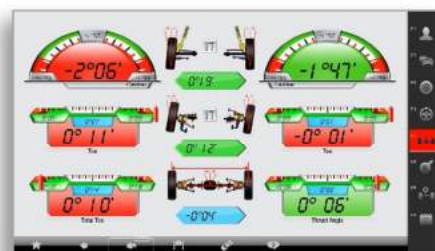
German Engineered 3D Alignment Software