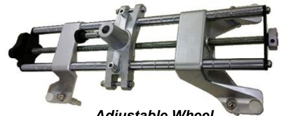
Adjustable Wheel Clamps 13" to 25"