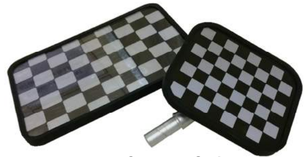
Compact Style Mini-Targets