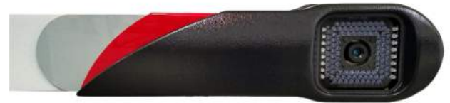
High Resolution 3D Industrial Cameras with LED Guide-On Assist