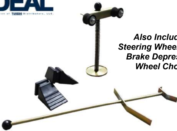
Also Included!! Steering Wheel Holder, Brake Depressor & Wheel Chocks