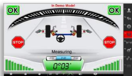
User-Friendly Screen Diagrams & Graphics