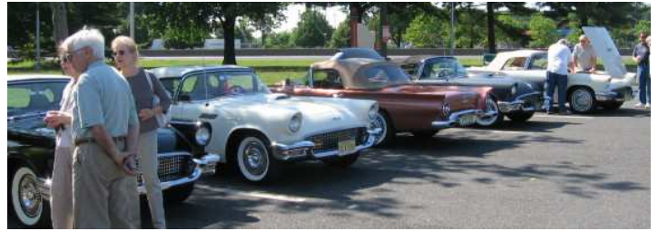
The caravan assembles - NJ Tpke