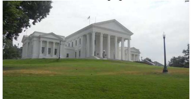
VA Capitol Bldg..