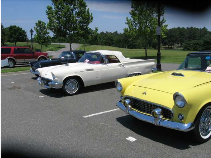
Three more of NJ's finest