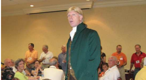
Thomas Jefferson orating