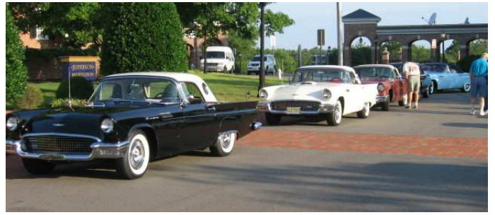
Lining up for the Driving Tour