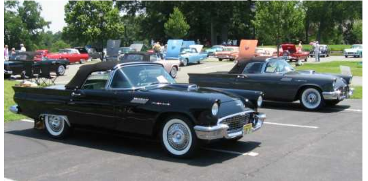
Gold and Silver