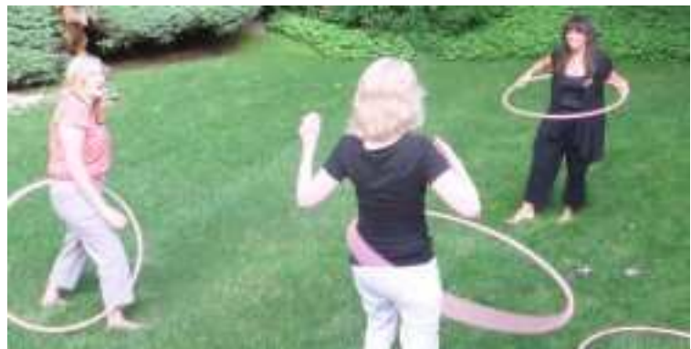
Teeny Boppers again??