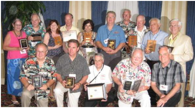
The award winners