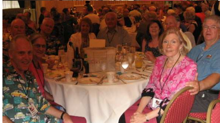
The banquet/awards dinner