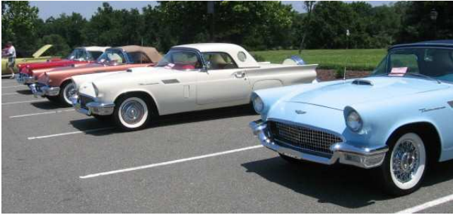
Three of NJ's finest