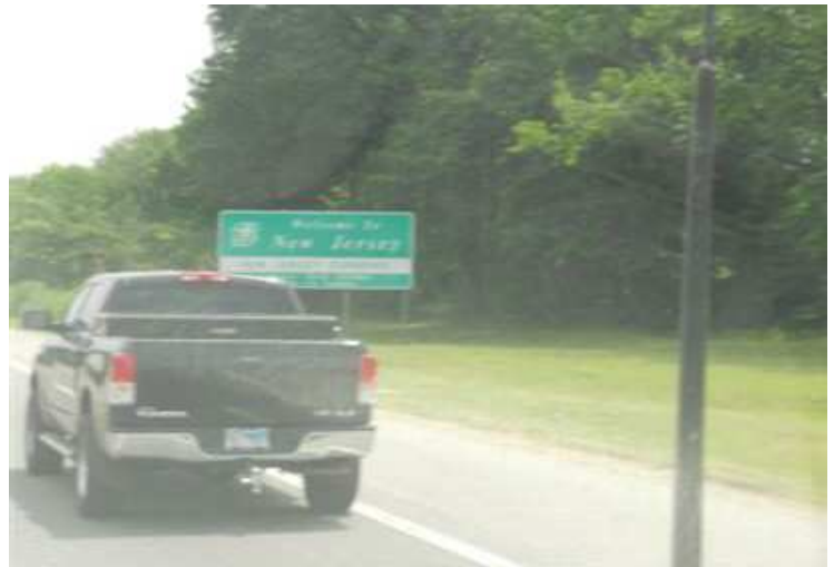
Back home after a good trip