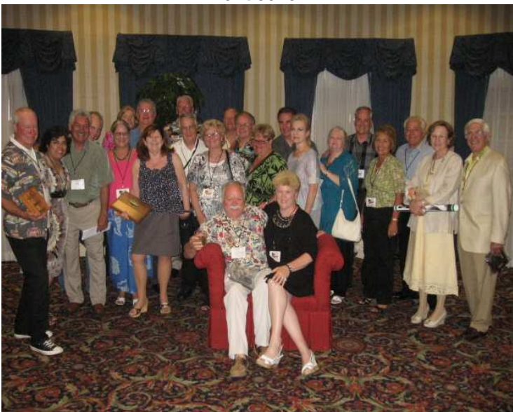
The whole crew