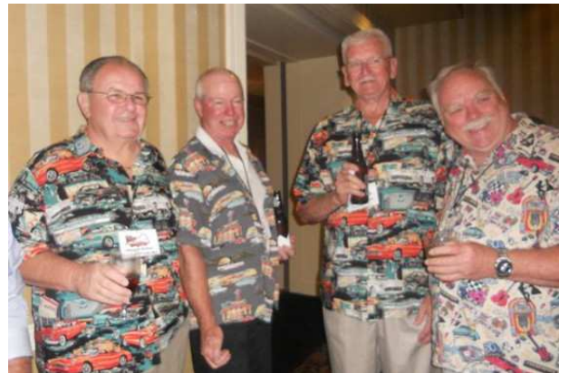
Do these guys have the same designer?

July is the month where you can eat with no guilt while celebrating the month. Among the foods feted in July are hot dogs, ice cream, peaches blueberries and catfish