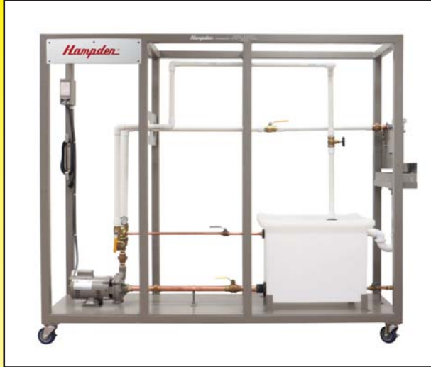
H-PPST-1 Piping/Pipefitters System Trainer

The Hampden Model H-PPST-1 Piping/ Pipefitters System Trainer provides the student with a hands on trainer for piping. The student will learn the necessary methods of connecting and running metal/iron piping, plastic piping, copper tubing, and hydraulic hose. Each material has its own particular methods used in plumbing.