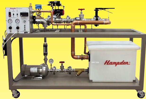
H-PVST-1 Pump and Valve System Trainer

The Hampden Model H-PVST-1 Pump and Valve System Trainer is a custom designed unit built to meet the plant specific training needs of the industrial facility. The trainer includes the basic facilities necessary to pump water (or other fluids) in a loop, together with the plant specific pump(s), valves and control configurations. Furthermore, all major components are flange fitted which allows easy removal from the unit. This will enable the trainee to learn the proper service procedures.