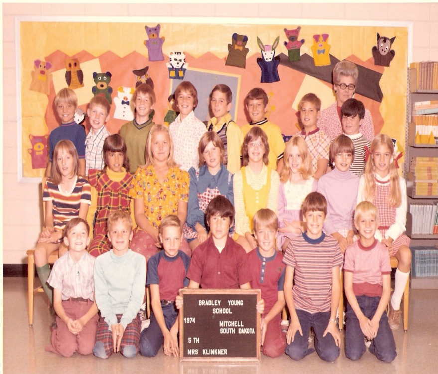
Fifth Grade, 1974-Bradley Young School