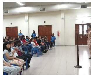
Talk on "The Dangers & Hazards of Smoking"