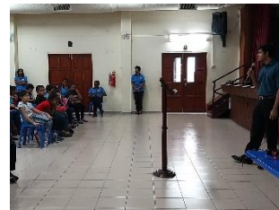
Talk on "The Short and Long Term Effects of Drug Abuse"