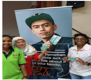
Organ Donation Campaign