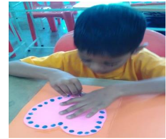
Fun Literacy activity for Learning Centre Students