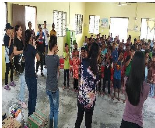
Sing Along with Orang Asli Children at Kg. Sinju