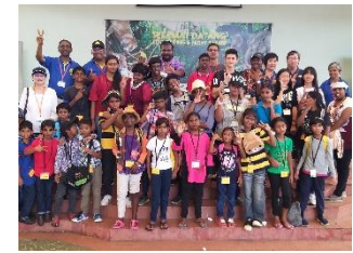
Outreach trip to Taiping Zoo for Learning Centre students