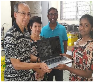
Presentation of Notebook to child of parishioner