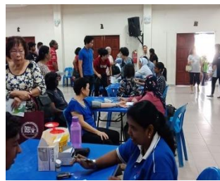
Health Screening Day – Blood Pressure Screening