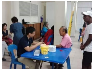
Health Screening Day – Blood Sugar Screening