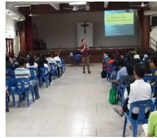
Talk on "Sexual Abuse"