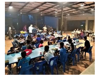
BBQ Nite for Learning Centre Students, Members and Guests