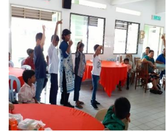
Dance presentation by Learning Centre Students at Home for the Aged (Simee)