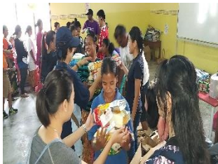
Presentation of food rations to Orang Asli families at Kg. Sinju