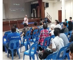
Talk on "Dangers of Using Plastics in Our Daily Lives"