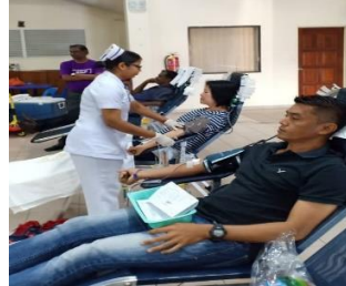
Blood Donation Campaign