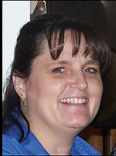
2010 After I was healed from eczema, and also my youth is restored