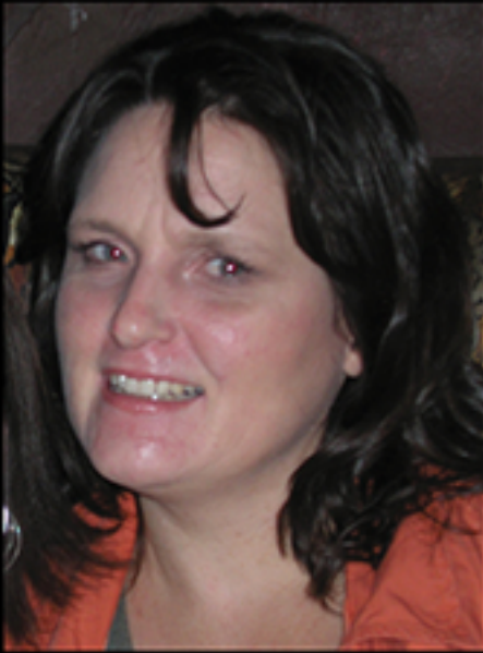
2006 Before I was healed of eczema