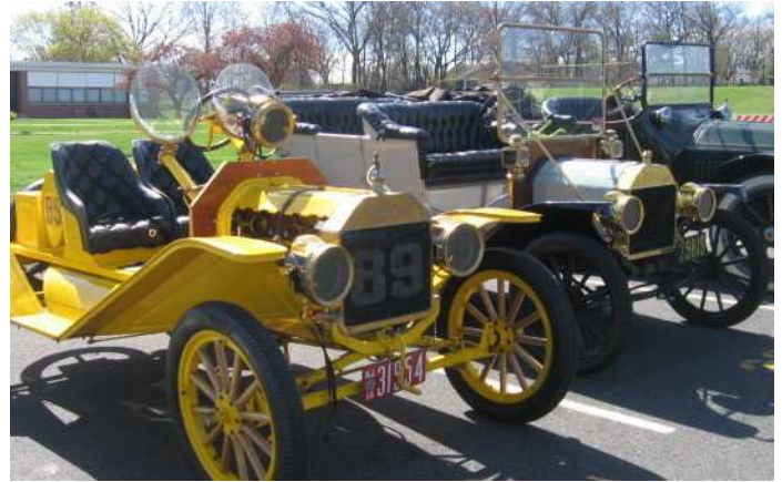
Two nice "T"s