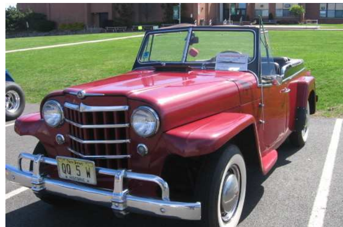
Remember the Jeepster?