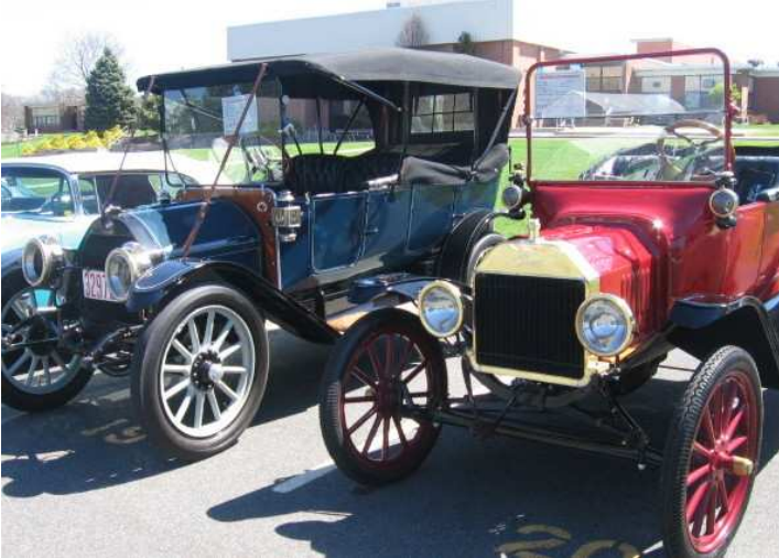
Caddy and a "T"