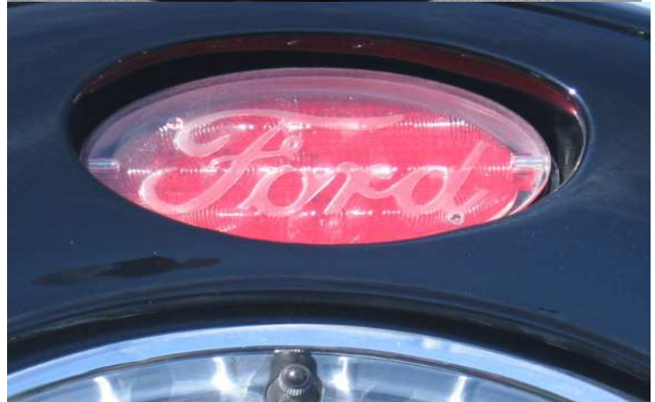
Third brake light on Paul A's car sunk into the continental kit