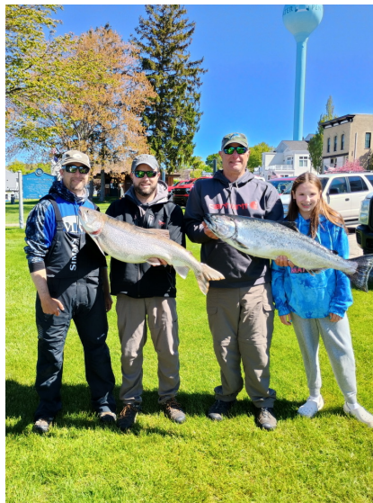
Lake Effect Team with Grand Prize King and 1 st Place Lake Trout

Brown Trout – 4.25# - Producer – Lyn Snider