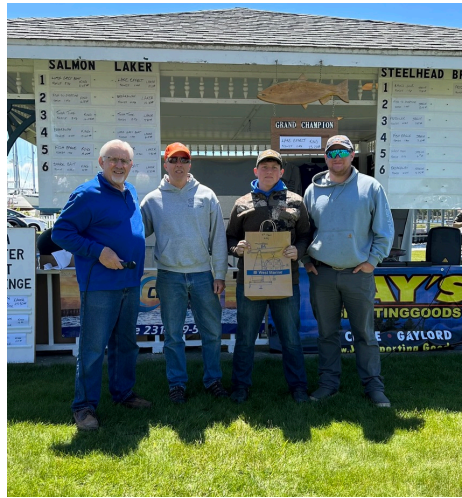
Fish Eagle Team won 5 th Place King and 4 th Place Steelhead