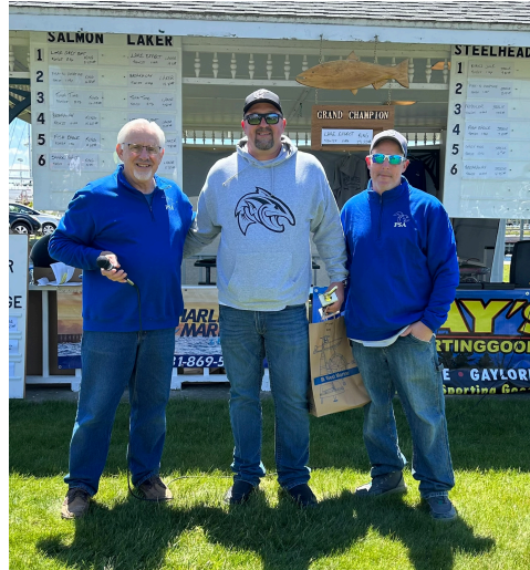
Fish-N-Overtime Team with 2 nd Place King and 2 nd Place Steelhead