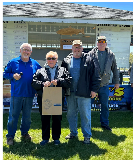
Producer Team won 5 th Place Lake Trout, 3 rd Place Steelhead and our Special Brown Trout Award