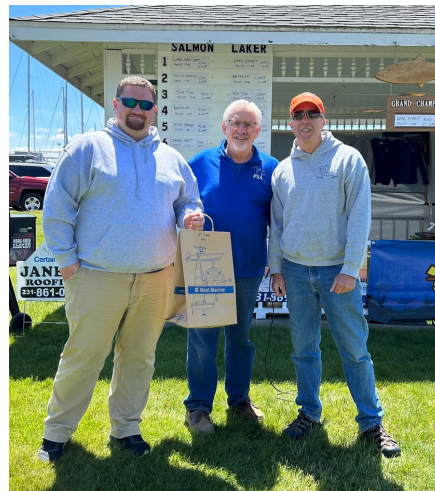
Shark Bait Team won 6 th Place King and 6 th Place Lake Trout