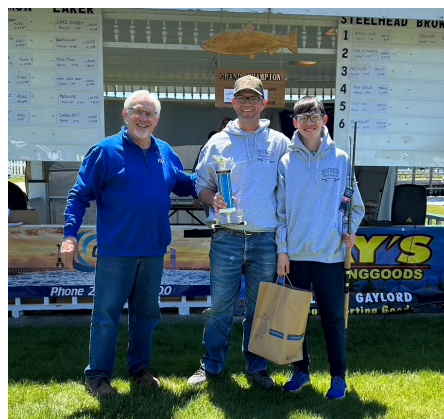
Little Grey Boat with 1 st Place King and 4 th Place Lake Trout