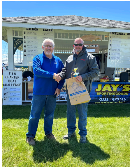
Tuna Time Team with 3 rd Place King and 3 rd Place Lake Trout