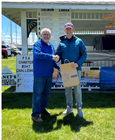
Breakaway Team won 4 th Place King, 2 nd Place Lake Trout and 6 th Place Steelhead