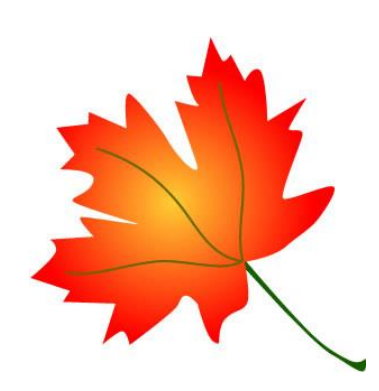
Identity will be revealed in the October newsletter.