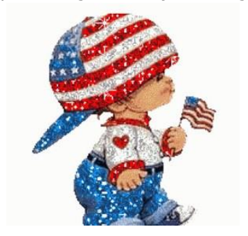
HUSBANDS AND WIVES

"It's simple", replied the girl. "You just change 'y' to 'i' and add 'es'."