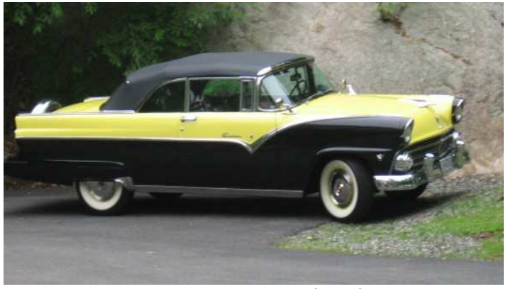
The newest member of the fleet.

A bus station is where the bus stops. A train station is where the train stops. On my desk, I have a work station.