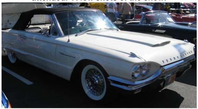
Joe Matrone's newest (was newest - see Pg 7)