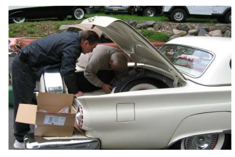
OK-one more June is item

June is rose month - so get your honey a rose