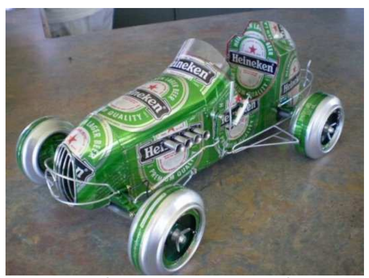
To go with beer month, but not American

For additional listings, go to www.njcarshows.com