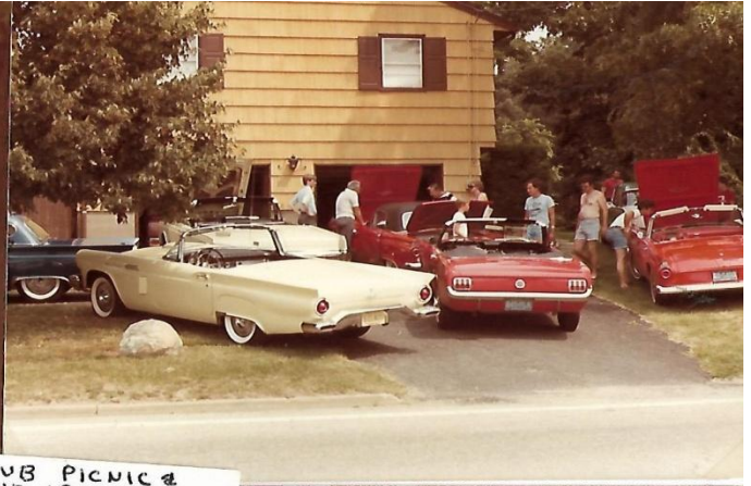
1982 CLUB PICNIC & TUNEUP CLINIC