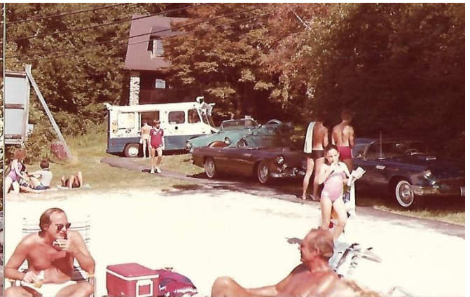
SUMMER PICNIC '83 RANDOLPH, N.J.