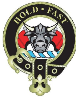
Clan MacLeod of Harris Septs: