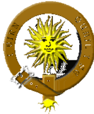
Clan MacLeod of Lewis Septs