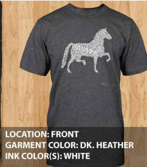
LOCATION: FRONT GARMENT COLOR: DK. HEATHER INK COLOR(S): WHITE

Gildan Softstyle® T-Shirt 65% polyester, 35% cotton Seamless double-needle 3/4" collar Taped neck and shoulders Rolled forward shoulder Double-needle sleeve and bottom hem Tubular fit for minimal torque Tear away label