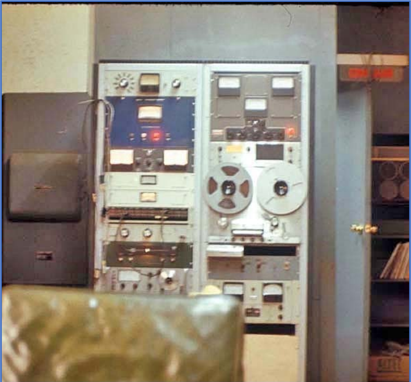
These are the tape recorders in the AM radio station. You can see the red "ON AIR" sign and door to the control room on the right.