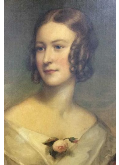
A TOP OFFERING AMONG FINE ART IS THIS ANTIQUE GEORGIAN SIR WILLIAM BEECHEY OIL ON CANVAS PORTRAIT TITLED THE LADY IN WHITE.

Among the standout artworks is a Georgian-era oil on canvas portrait of a fashionable woman in white by Sir William Beechey, the official painter of portraits to the British royal family in the late 1700s and early 1800s; an energetic contemporary painting by Joe Taylor recreating the album cover of Buckwheat Zydeco's Hey Joe and measures about 6 by 6 feet; a rare and early folk art painting