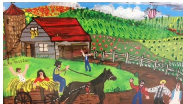
RARE EARLY FOLKY OIL ON CANVAS, SIGNED CHARLES FAZZINO, 1893, DEPICTING PEOPLE ON A FARM, A HOT AIR BALLOON AND A HORSE-DRAWN HAY WAGON, 11 INCHES BY 13 INCHES.

by Charles Fazzino (b 1955), dated 1983, a 13-inch by 11-inch painting of people on a farm, a hot air balloon and a horse-drawn wagon filled with hay and riders; and a colorful painting by Norma Solomon (N.Y., b. 1942). For more info, click here.