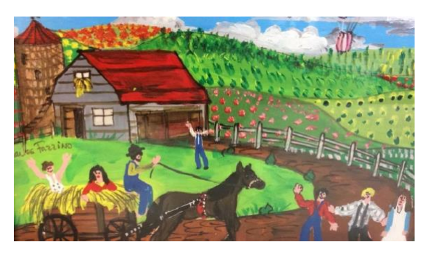
RARE EARLY FOLKY OIL ON CANVAS, SIGNED CHARLES FAZZINO, 1893, DEPICTING PEOPLE ON A FARM, A HOT AIR BALLOON AND A HORSE-DRAWN HAY WAGON, 11 INCHES BY 13 INCHES.

Among the standout artworks is a Georgian-era oil on canvas portrait of a fashionable woman in white by Sir William Beechey, the official painter of portraits to the British royal family in the late 1700s and early 1800s; an energetic contemporary painting by Joe Taylor recreating the album cover of Buckwheat Zydeco's Hey Joe and measures about 6 by 6 feet; a rare and early folk art painting