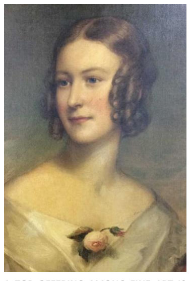
A TOP OFFERING AMONG FINE ART IS THIS ANTIQUE GEORGIAN SIR WILLIAM BEECHEY OIL ON CANVAS PORTRAIT TITLED THE LADY IN WHITE.

by Charles Fazzino (b 1955), dated 1983, a 13-inch by 11-inch painting of people on a farm, a hot air balloon and a horse-drawn wagon filled with hay and riders; and a colorful painting by Norma Solomon (N.Y., b. 1942). For more info, click here.