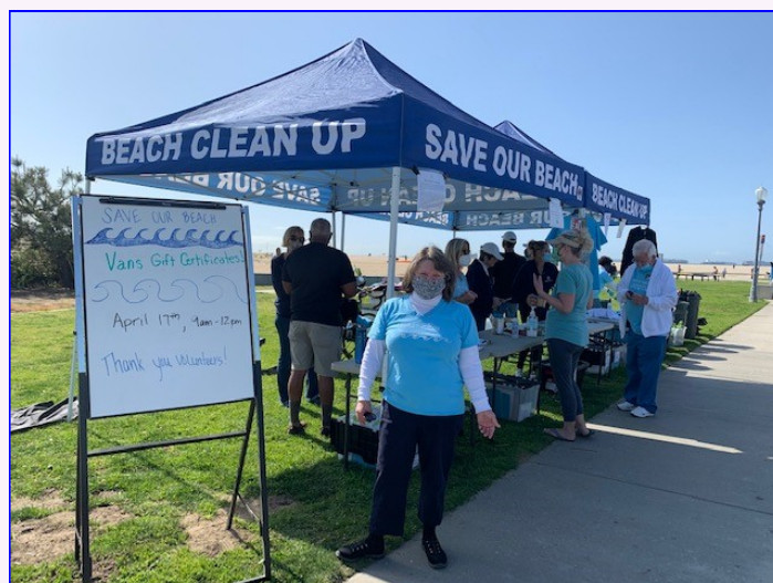
Representing Bethlehem at Spring Seal Beach beach cleanup

Those pictures have been taken at Kule two refugee camps during our youth conference in January 2021. Thank you so much for your time that you spent when you read my newsletter at this time and may God bless us all.